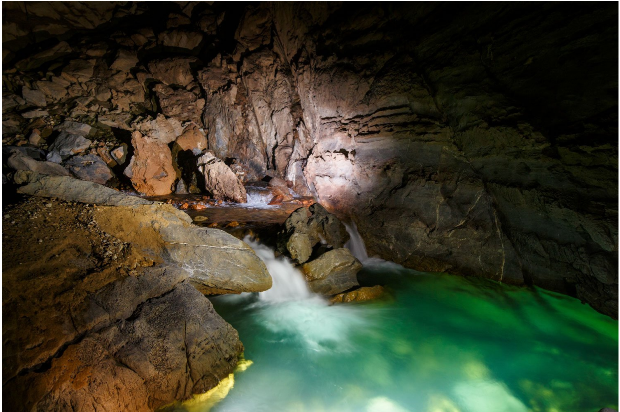
Nuoc Nut Cave

A picnic lunch will be provided at the entrance of Nuoc Nut Cave.